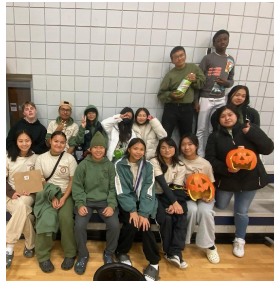
Right: The MCJROTC Cadets in support of the Halloween Carnival at the Palace Recreation Center on Thursday 4pm-8pm. Thanks for all you gave back to the community.